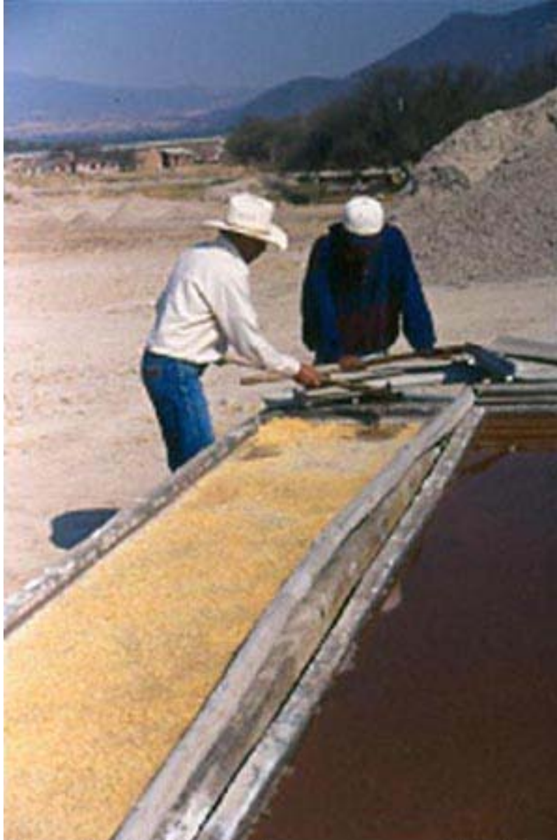
Figure 4. Wooden troughs, or canoas, used in the solar evaporation of brine.

The tools used by the saltmakers or salineros are quite simple, and do not differ from tools used in agriculture or other work, such as house construction: shovels, hoes, and picks to excavate the soil, wheelbarrows to take it to the estiladera , buckets to take the water to the canoas . The tools used in the past, however, were quite different: a type of sack made of jute fiber called guangoche was used to carry the earth, and clay vessels known as chondas ( Figure 5a , shown below) were used to carry the water within the finca .