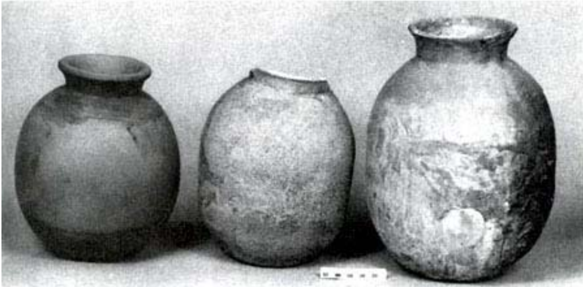
Figure 5a. Clay vessels, known as chondas, formerly used in the study area to carry water and brine; they have been replaced by plastic buckets.

The process of salt production can be divided into four stages in Araró and Simirao: (1) soils are extracted, mixed and prepared; (2) brine is obtained by leaching the earth in the estiladera ; (3) brine is evaporated by the sun in the canoas and salt is collected; (4) the finished product is packed and sold.