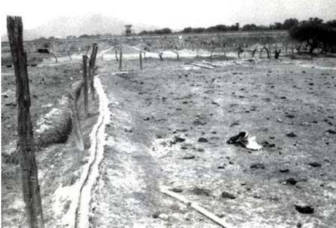
Figure 8. This canal is used to take water from the springs to the fincas. The water's high mineral content has "fossilized" this feature.