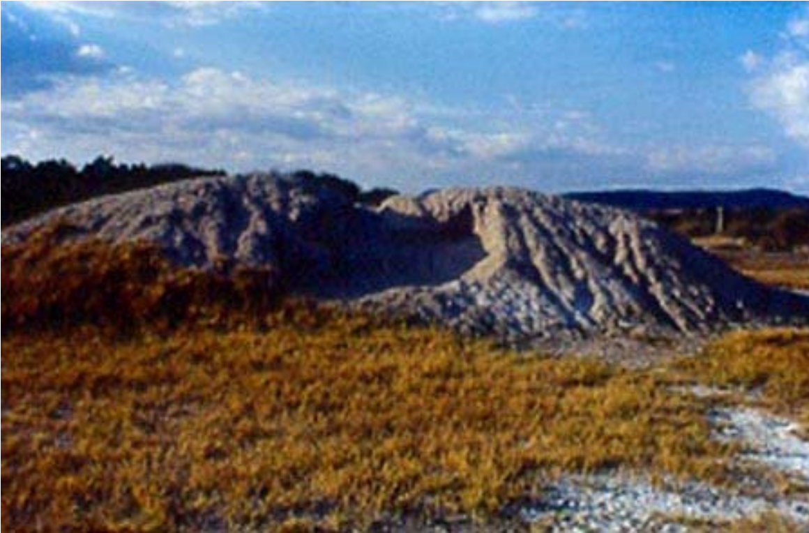
Figure 7. This mound of leached soil, locally known as a terrero, results from the accumulation of discarded earth after each salt-making operation.