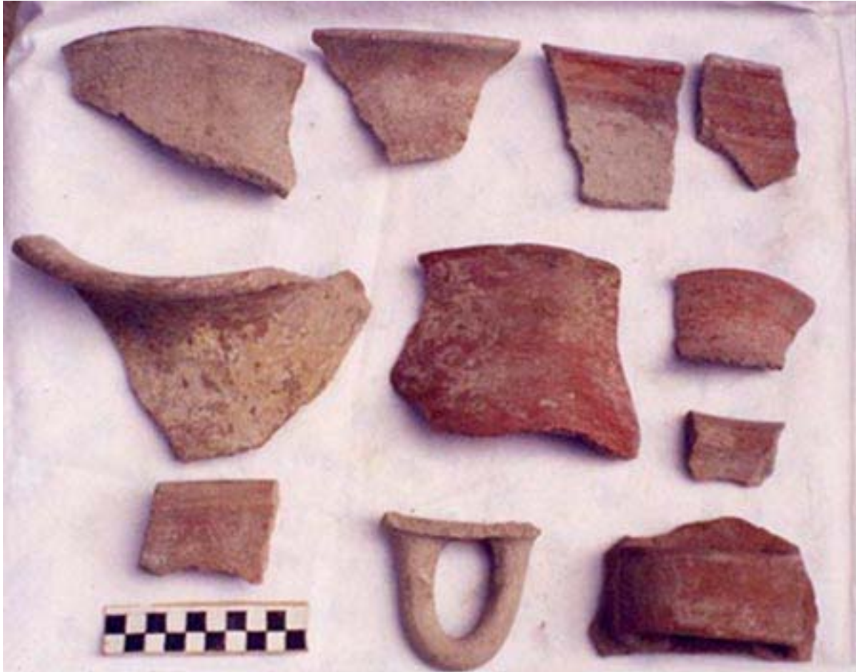
Figure 5b. Pottery fragments found during the 2003 field season. They may have been used in ancient times to store or transport water and brine.