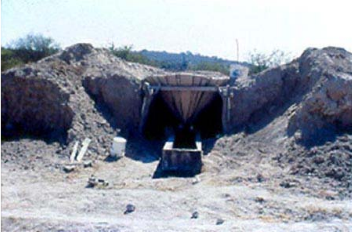
Figure 3. Estiladera, wooden element used to extract brine from the earth by leaching.

Each salt-producing unit in Araró and Simirao is known as a finca ( Figure 2 ). The finca consists of two or more estiladeras , wooden structures that are used as filters to separate the salt from the earth by leaching. These funnel-like structures are oval-shaped at the top, and measure some 1.5 m in height ( Figure 3 , shown above). In every finca there are several canoas (wooden troughs, manufactured like dugout canoes, or new ones made of cement) ( Figure 4 , shown below) measuring between 6 and 10 m in length, where the brine that has been filtered in the estiladera is evaporated by the sun.