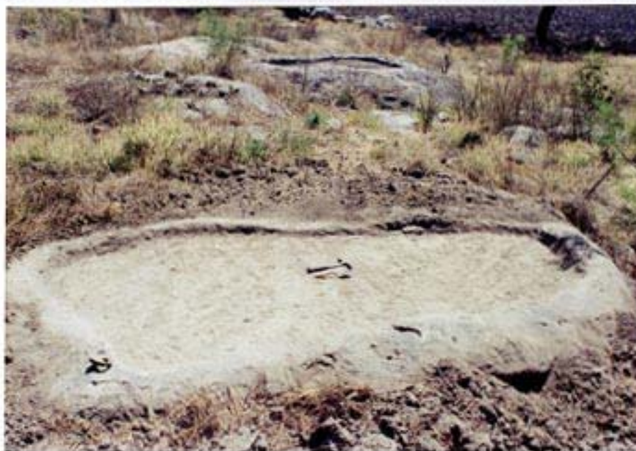
Figure 6. Shallow pools, like the ones excavated in the bedrock near Chucándiro, at the western tip of Lake Cuitzeo, may have been used in Prehispanic or Colonial times for the solar evaporation of brine.

To identify archaeological sites that represent ancient salt-making localities, it is important to understand the processes involved in this activity, as well as to know the material remains or traces that these processes leave on the landscape, since salt itself is usually not preserved in the archaeological record. Prehispanic saltworks performed basically the same functions with similar tools as the ones we see in the area today, with stone, wood, clay, and fibers instead of plastic, metal, and other modern materials.