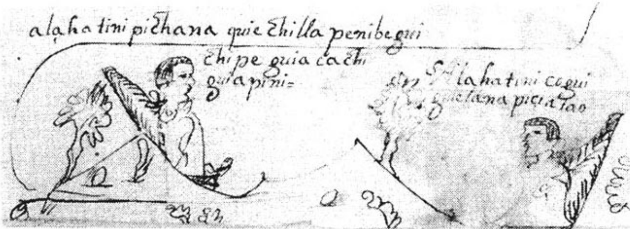
Figure 3. Depiction of Lord 1 Cayman (left) and Lord 6 Death Great Eagle (right) in the Genealogía de San Lucas Quiaviní.