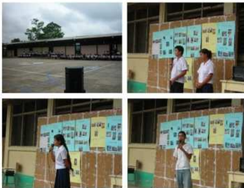
Figure 17b. Students' presentation at the Instituto Paraíso Occidental.