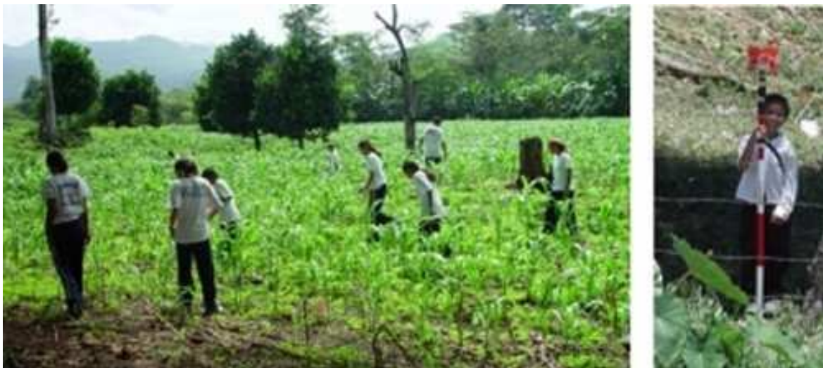
Figure 5. Students helping with reconnaissance and survey.

During the 2007 season, and with generous funding from FAMSI, PAREP began a formalized phase of community involvement by including a group of local high-school students in research efforts.