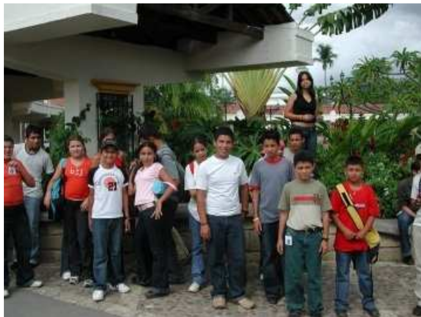
Figure 4. UDAP members visiting Copán in summer 2005.