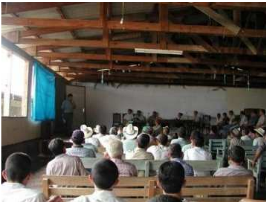
Figure 3. Lecturing to the community.