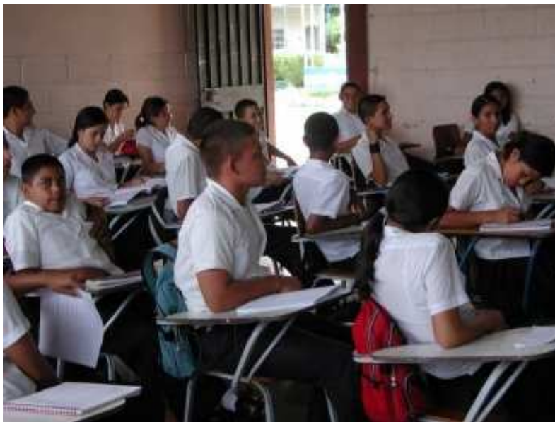
Figure 6. Students of the Instituto Paraíso Occidental.