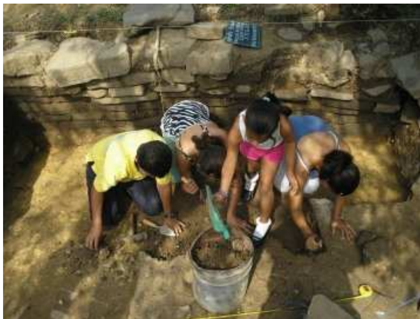
Figure 1. Students excavating at El Paraíso.