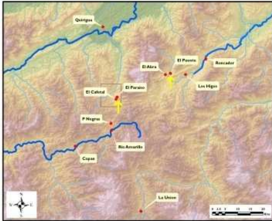
Figure 15. Sites in the El Paraíso valley in relation to El Puente.