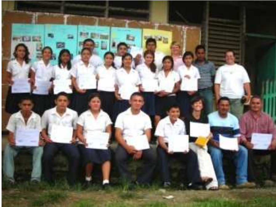
Figure 18. PAREP members and students proudly displaying their diplomas.