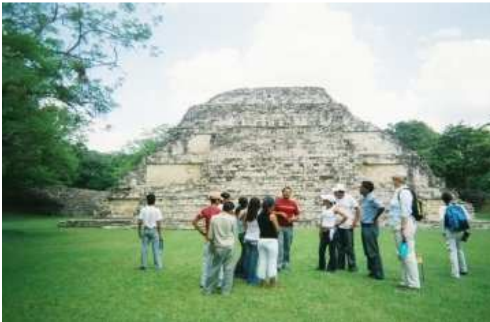
Figure 16. Santiago Escobar Morales (in red) lectures during a fieldtrip to El Puente.