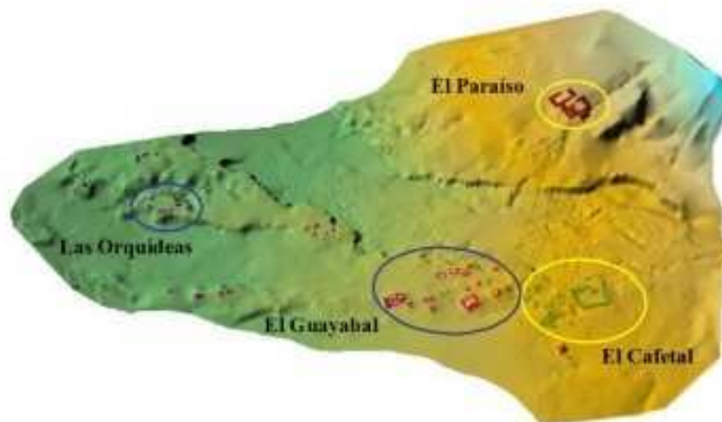
Figure 9. El Paraíso, El Cafetal, and El Guayabal in the El Paraíso valley.

Students were then split into groups and assigned to work at one of the three sites under the supervision of PAREP researchers ( Figure 9 ). As PAREP members had been conducting excavations at the three sites prior to the start of the student research program, students were able to see and participate in various stages of the investigative process. From PAREP members, which include professional archaeologists and American and Honduran college students, they learned about excavation, documentation, mapping, and surveying. Experienced project workers from the local community also assisted with students' instruction.