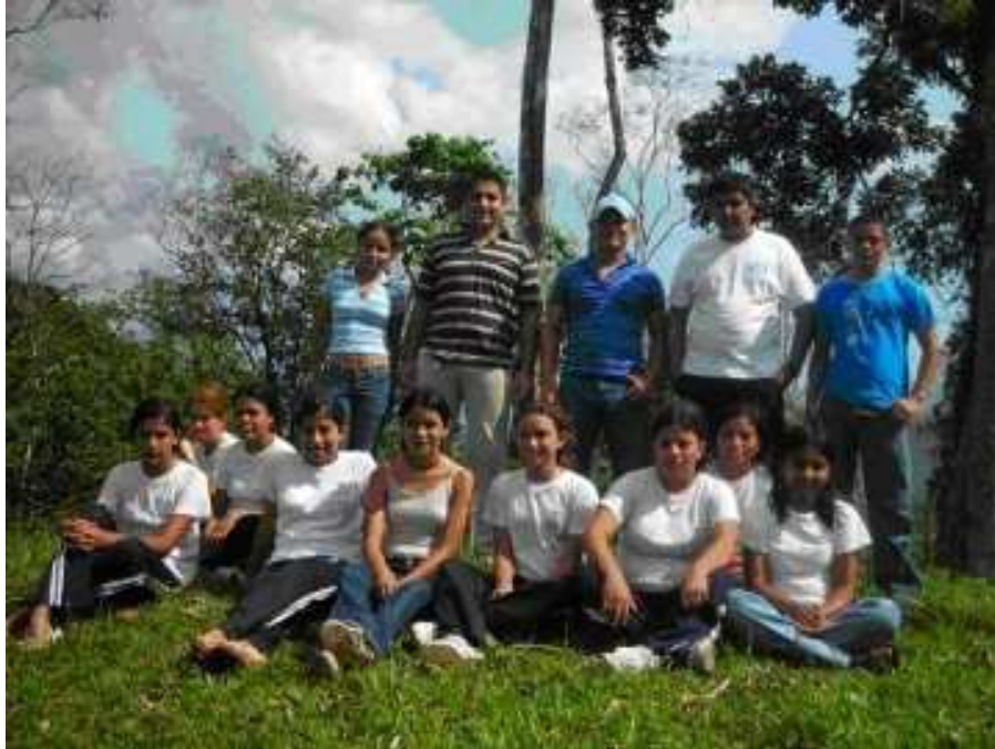
Figure 7. Students participating in the research program at El Guayabal; not all are pictured.*

First and foremost, the student research program was designed to accommodate students' school schedule. Students attended school in the morning, and during the afternoon they were in the field. Exams and a weeklong vacation also coincided with the research program. While students were not permitted in the field during exams, they had the option to participate in excavations and lab work during their vacation. Several students chose to do so.