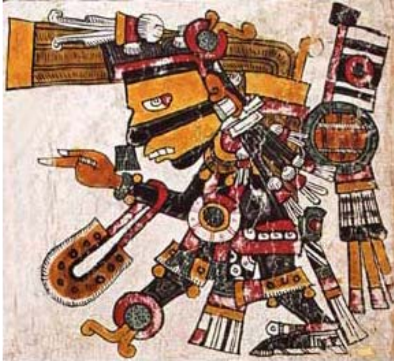
Figure 3. Black Tezcatlipoca, Codex Borgia, p. 21.