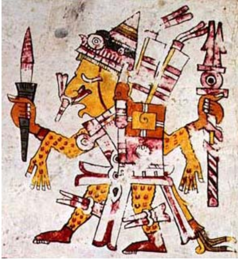
Figure 2. Xipe Totec, Codex Borgia, p. 61.

As the Red Tezcatlipoca he is associated with Xipe Totec, a solar god worshipped around the spring equinox. The Black Tezcatlipoca is merged with another solar god, Huitzilopochtli, whose principal ceremony took place at the onset of the dry season. Tezcatlipoca has other aspects linked with the night sky, the moon, the planets, and the stars, especially those in Ursa Major.