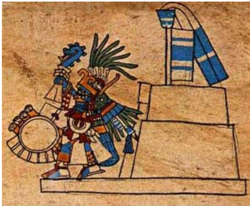
Figure 4. Huitzilopochtli, Codex Borbonicus, p. 34.

The second chapter will focus on the single most important astronomical ritual in the Aztec calendar, the New Fire Ceremony, when the Aztecs looked to the heavens for signs confirming the continuity of the world.