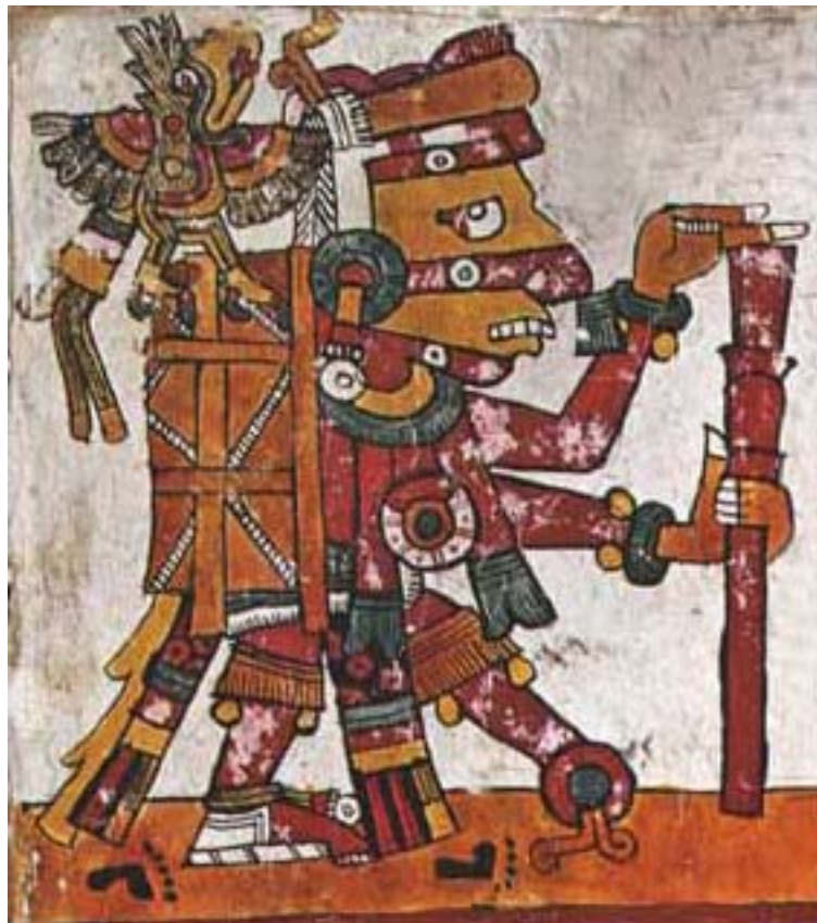
Figure 1. Red Tezcatlipoca, Codex Borgia, p.21.

I have just begun to digest the massive amount of research material I compiled this year, and I anticipate the process of writing the book on Aztec Astronomy will begin in the late summer. I have outlined the topics for the book, and have already completed the first chapter, focusing on the astronomical images and ceremonies associated with Tezcatlipoca. His multiple aspects provide a key to understanding the way astrology and astronomy were incorporated in Aztec religion and the festival calendar.